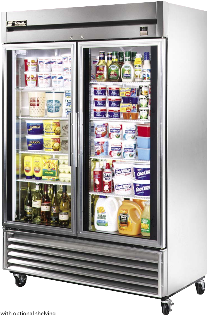
Photo shown with optional shelving.

TS Series: Reach-In All Stainless Steel Glass Door Refrigerator